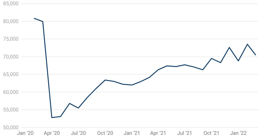
Chart: Center for the Study of Child Care Employment, UC Berkeley • Source: U.S. Bureau of Labor Statistics, "Current Employment Statistics," available at https://beta.bls.gov/dataViewer/view/4918eefb944741d5aeb3d89dee5e5705 • Created with Datawrapper

The industry has experienced a slow and incomplete recovery following sharp job losses at the start of the pandemic.